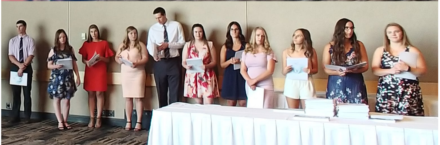
Graduating Class of 2018