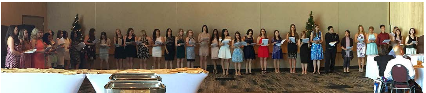
Graduating Class of 2017

For many graduates, June 8, 2017, was a time to enjoy one last day together. The graduation banquet and dance followed later that evening.