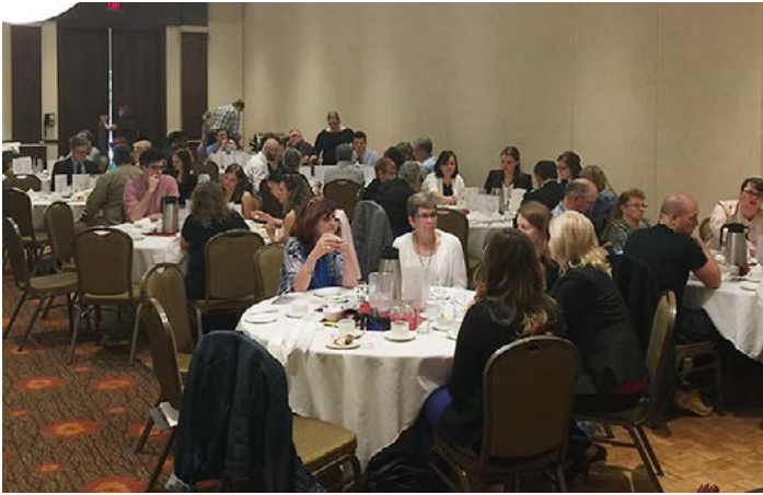
First Annual SCPP Pharmacy Technician Graduation Luncheon

The first annual SCPP Graduation Luncheon for the graduates of the Pharmacy Technician program at Saskatchewan Polytechnic was held at the Hilton Garden Inn on May 26, 2017.