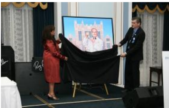
Centennial Art Commission is unveiled