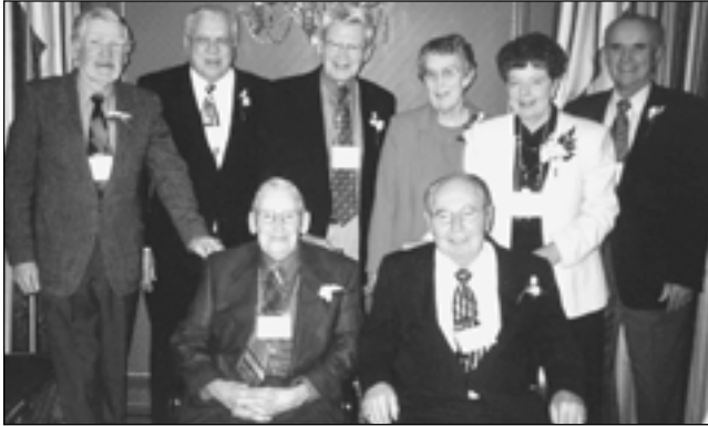
CLASS OF 1951