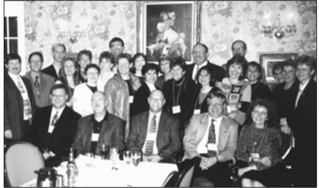
CLASS OF 1976